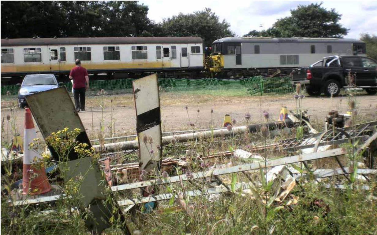
Electro-Diesel No.73130 prepares to depart on another run to the buffers and back. The actual running line was not much more than a few hundred yards in length, however, it was enough to give the impression that you were actually going somewhere.