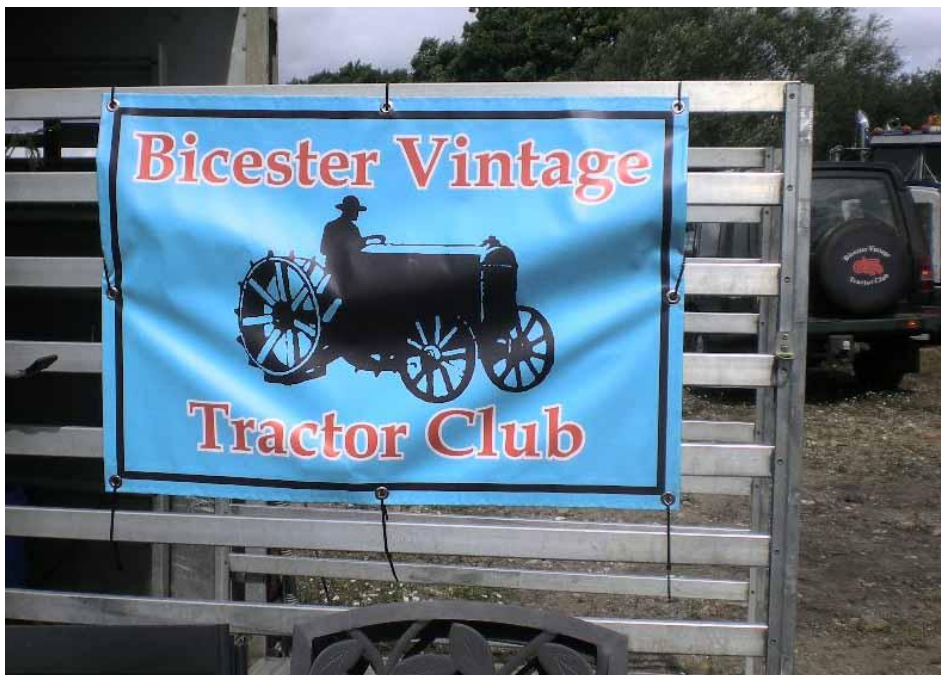
For those of an 'agricultural' persuasion, the Bicester Vintage Tractor Club was very well represented with a substantial number of exhibits.