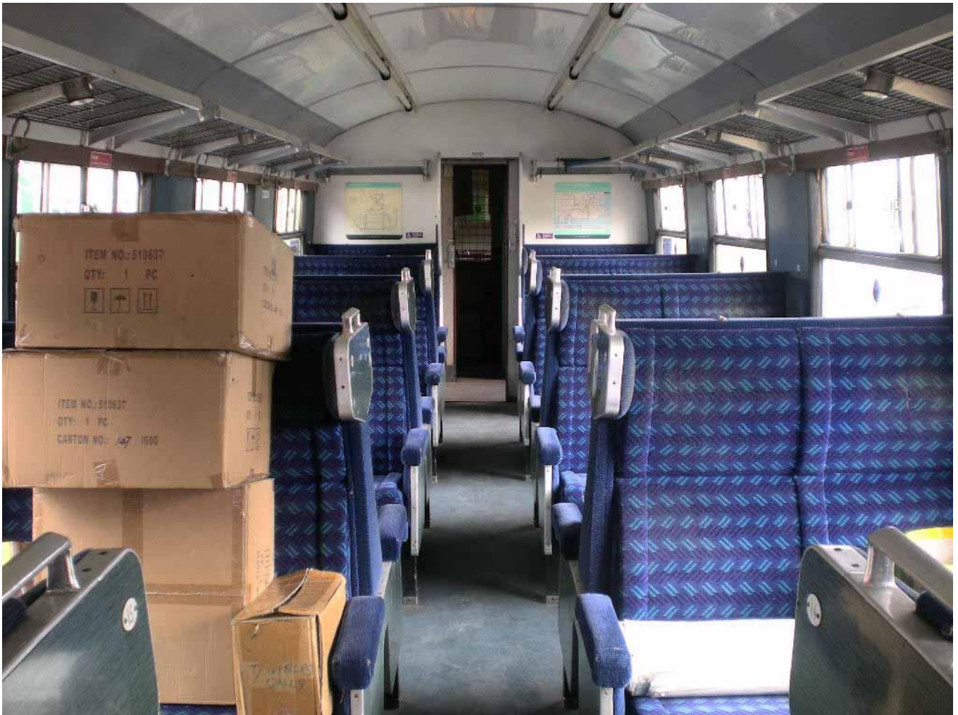
Interior of 4-CIG N.1753

Whilst all the preparations were going ahead, I decided to take a look inside the interior of 1753 and I was very impressed with how clean and tidy it was, however, to be quite realistic here, back in the day of packed commuter trains which allowed people to smoke inside, I doubt whether the interiors would have been as pristine as seen here. Another consideration was that the toilets used to empty directly down onto the tracks and the signs requesting 'please do not use the toilet whilst the train is standing in the station.